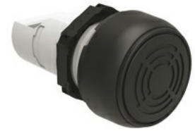
Monoblock buzzer - Continuous or pulse tone LPCZS